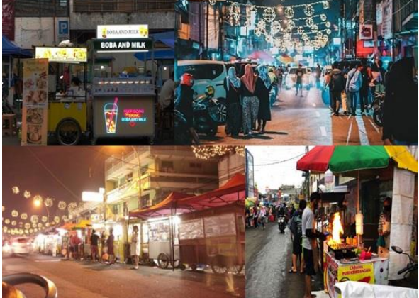
Figure 1. The atmosphere of Tangerang Old Market

And based on the above background, the author intends to research on Consumer Purchase Decisions in the Tangerang Old Market with Consumer Satisfaction as an Intervening Factor.