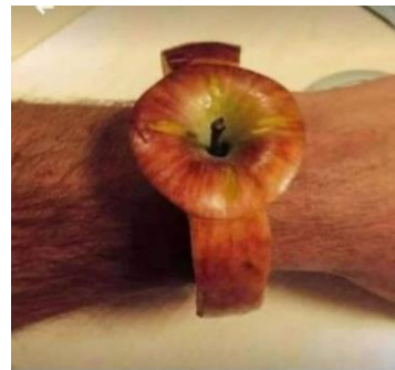
Genuine apple watch