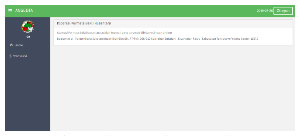
Fig 5. Main Menu Display Member