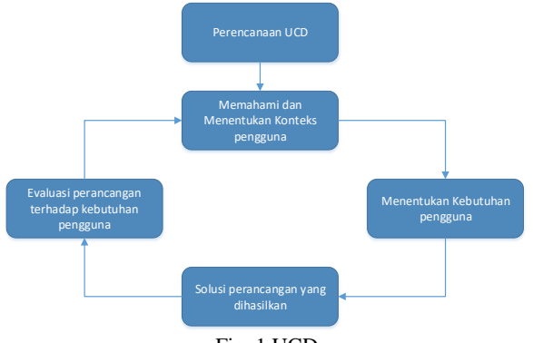
Fig. 1 UCD

Reveal Concept of UCD is the user as the center of the system development process, and the purpose/nature, context and environment systems are all based on the user experience [3]. The process of Method User Centered Design (UCD) based on ISO 9241-210 2010 there are five processes, namely as figure 1 below.