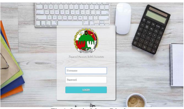
Fig 1. Login Menu Display

After doing research on cooperative gem Bakti Nusantara then it may be a solution in the form of Savings and Loans Information System Web-Based User Centered Design Method Using the following display design results in the application, namely: