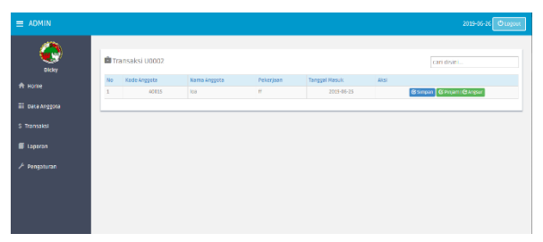
Fig 4. Transaction Menu Display Save and Loan Administrator