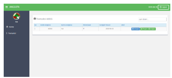
Fig 6. Member Transaction Menu Display